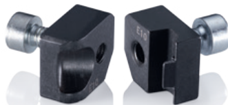
insert E10 for gripping tool