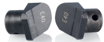
insert ILT E40